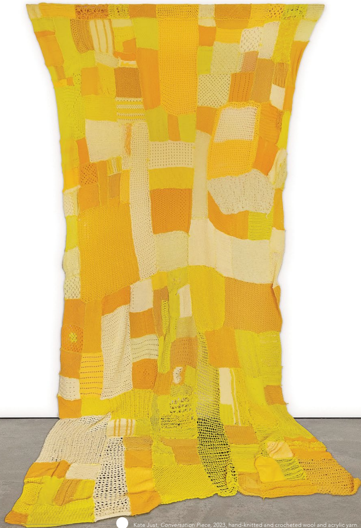
Kate Just, Conversation Piece , 2023, hand-knitted and crocheted wool and acrylic yarn.